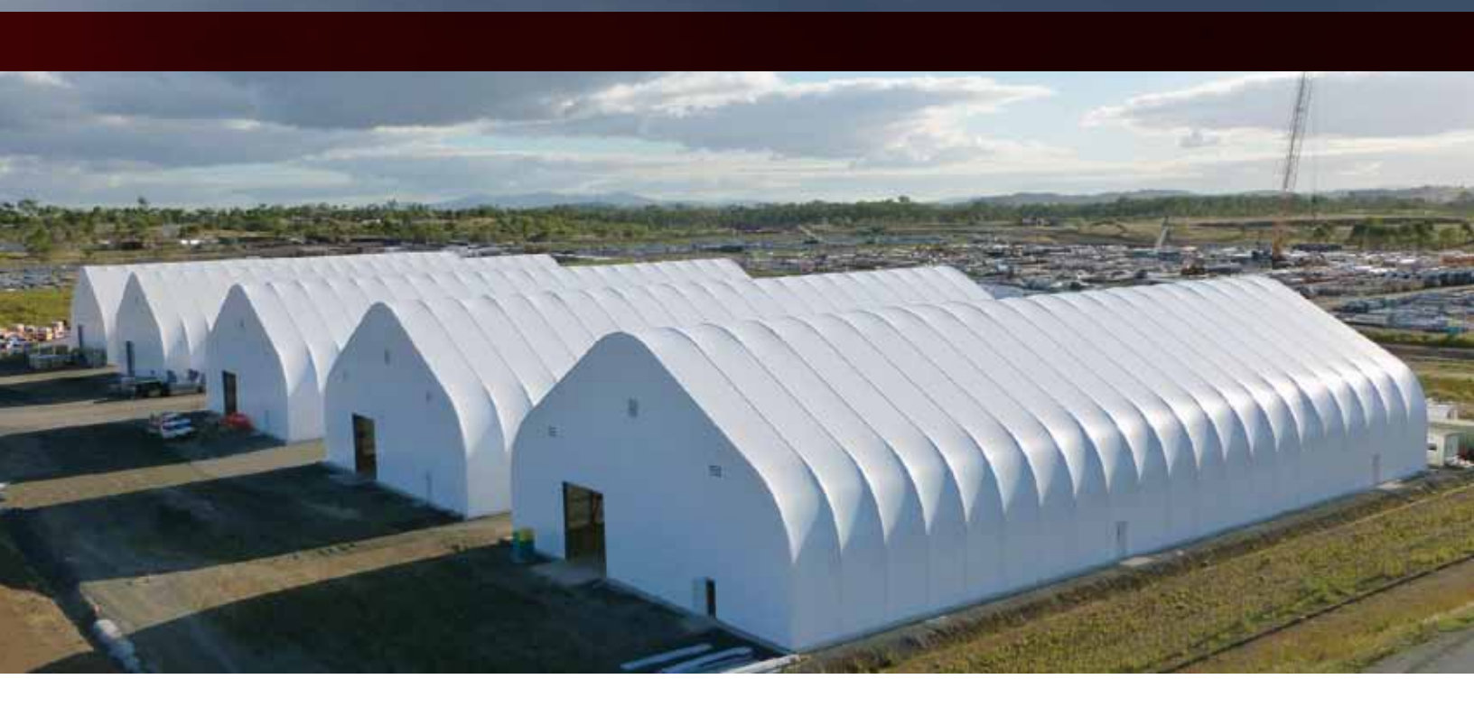
WAREHOUSING & STORAGE | Clear-span space; bright interiors; can be built in remote locations; versatile